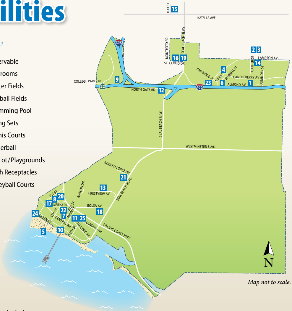
Map not to scale.